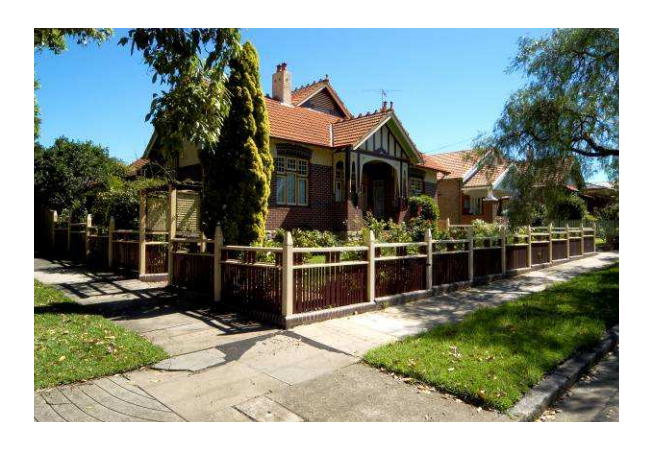
From top: Cadia copper mine's Engine House near Orange, c.1867; St Patrick's seminary, Manly, 1885, now converted to a college; New houses and subdivision of St Patrick's grounds retain its significant setting and trees; A characteristic Federation residence, c.1910.