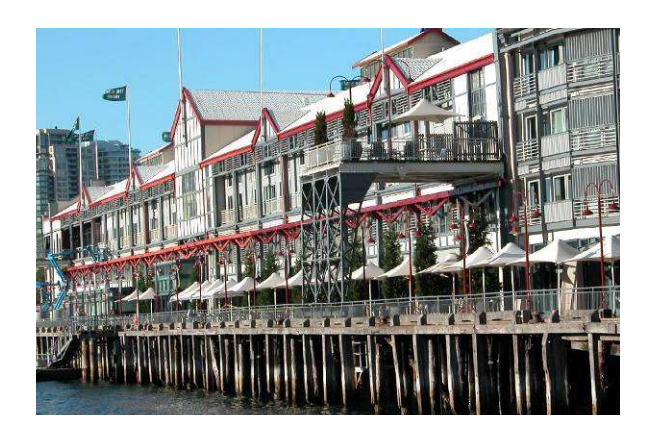
Listing keeps heritage places authentic, alive and useful.