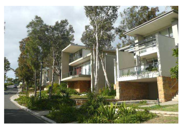
Retaining our limited heritage resources is green, sustainable, an investment and community building.