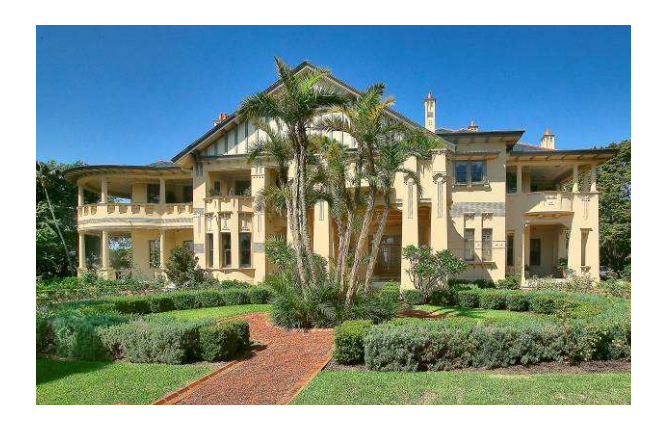
Listing gives owners improved access to heritage grants.