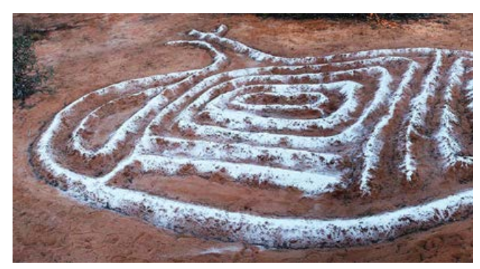
The Trust's Protecting our Places grantee Mothers Ancestral Guardians Indigenous Corporation – or MAGIC – conducts a Malleefowl Ceremony in Rick Farley Reserve, far west NSW