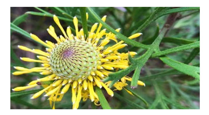
'Drumsticks' – or Isopogon anemonifolius – at Kincumba Mountain, Green Point Trust grantee Community Environment Network (CEN) for the COSS connections and rehabilitation project