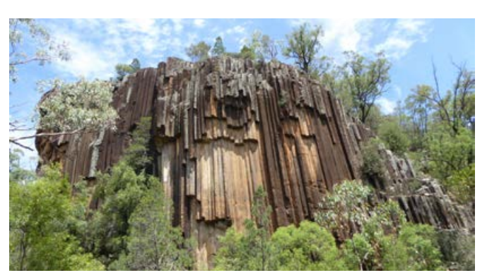
Rock formation, Sawn Rocks, Mount Kaputar National Park