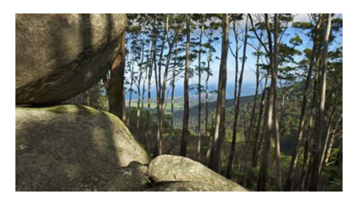
View to the coast from the Granite Tors in Gulaga National Park