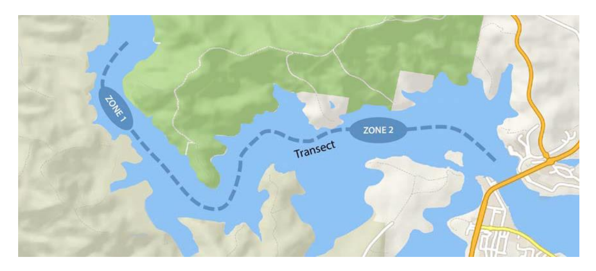
Figure 2: River sampling strategy

If feasible, rivers are sampled using a longitudinal transect from the mid section to the upper section (Figure 2).