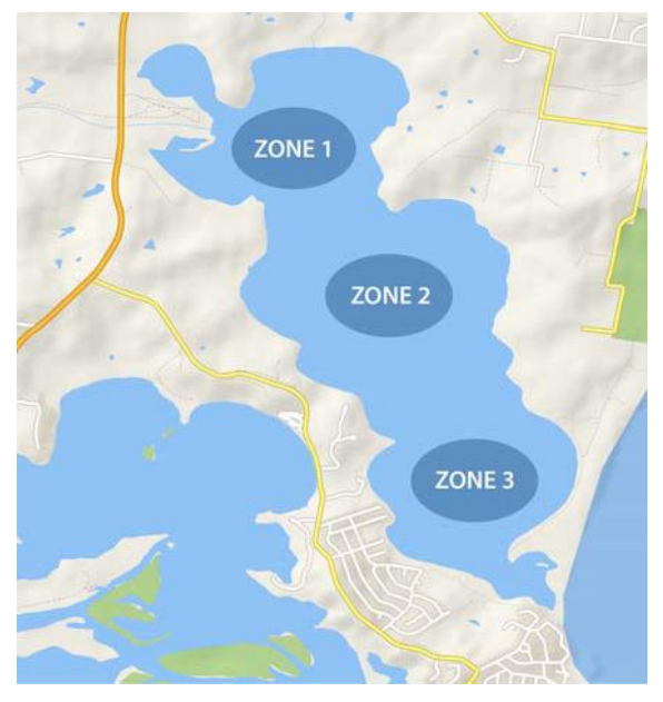
Figure 1: Coastal lake or lagoon sampling strategy

If feasible, rivers are sampled using a longitudinal transect from the mid section to the upper section (Figure 2).